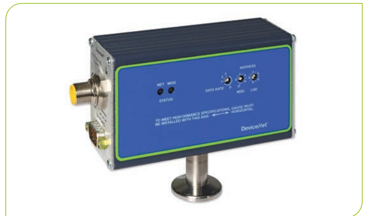
Rear View Convectron® ATM Module

With over 35 years of successful field installations, the Convectron gauge has become an industry standard for low vacuum measurement. Unlike traditional thermocouple and Pirani gauges, Convectron gauges take advantage of heat loss due to convection cooling at higher pressure that extends the range of the Convectron's measurement to atmosphere. The performance of this module at atmosphere is now enhanced with the addition of a piezo-resistive diaphragm in the same package. This sensor provides a highly reliable, accurate, and repeatable indication of differential pressure at atmosphere to improve process efficiency and throughput.